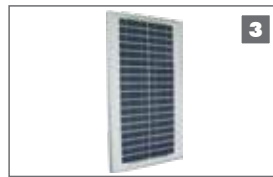
Solar Supply Alternative means of powering the system - consult your CENTSYS dealer