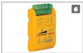
FLUX SA Loop Detector Allows free-exit of vehicles from the property - requires ground loop to be fitted