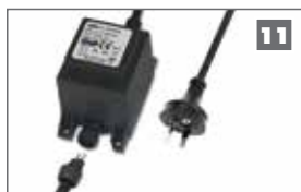
Low-voltage Power Supply If 240V power at the gate is not feasible, this optional low-voltage power supply kit is a simple, cost effective option