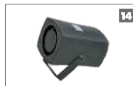
12V-24V SMART Siren A top-notch security companion, designed to seamlessly integrate with your existing SMART gate and garage door operators (not shown in diagram) (not compatible with D3 SMART)