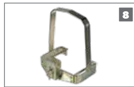
Theft-Deterrent Cage & Padlock Patented design provides excellent deterrence against theft, tampering and vandalism