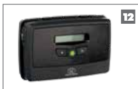
G-ULTRA The ultimate GSM solution for monitoring and activating the operator via your mobile phone