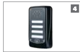
Metal Gate Station Communication hub for the G-SPEAK ULTRA GSM intercom - available in stylish and strong metal enclosures