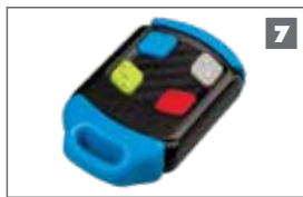
CENTSYS Transmitters Available in one-, two- and four-button variants. Incorporates code-hopping encryption