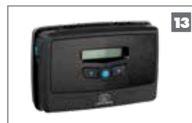
G-SPEAK ULTRA Answer your intercom from anywhere for maximum security and convenience - powered by 4G technology