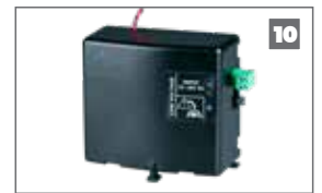
Low-voltage Charger Enjoy a safe, reliable and cost-effective way to power your gate operator and enjoy outstanding performance and exceptional flexibility