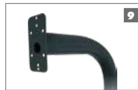
Gooseneck Steel pole for mounting intercom gate station or access control reader