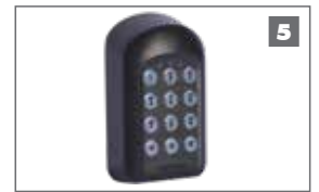
SMARTGUARD or SMARTGUARDair Keypad Cost-effective and versatile wired and wireless keypad, allowing access to users with a customised code