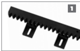
Steel Reinforced Nylon Rack Keeps sliding gates running smoothly - reinforced for added strength and performance