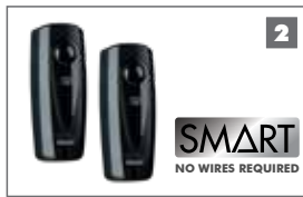
Photon SMART PE Beams Fully-wireless PE safety beams. Always recommended on any SMART automated installation